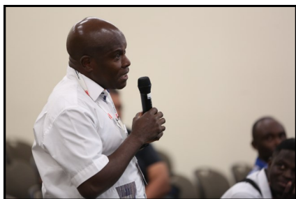
A member of the Africa Association for Food Protection raises a question at the Affiliate's Annual Meeting in St. Louis, Missouri.

members. A call was made to engage in recruiting students and industrialists where possible. University employees are instrumental to help recruit students as future leaders of AAFP.