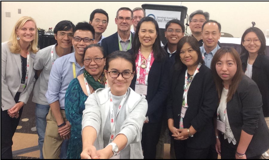
Attendees at the Southeast Asia Association for Food Protection's Annual Meeting pose for a photo following their Annual Meeting, held during IAFP 2016.