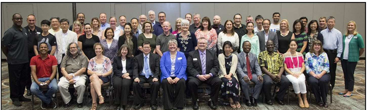
IAFP Affiliate Council Meeting, July 31, 2016.