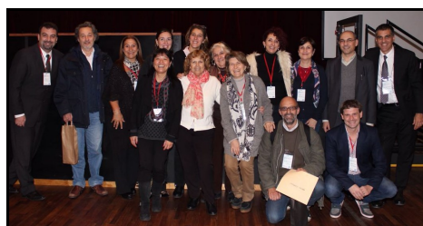
The Planning Committee for the Argentine Food Safety Commission's first symposium poses for a photo at the completion of the two-day event.

The Affiliate's inaugural meeting received positive feedback about content and speakers from most of the attendees.