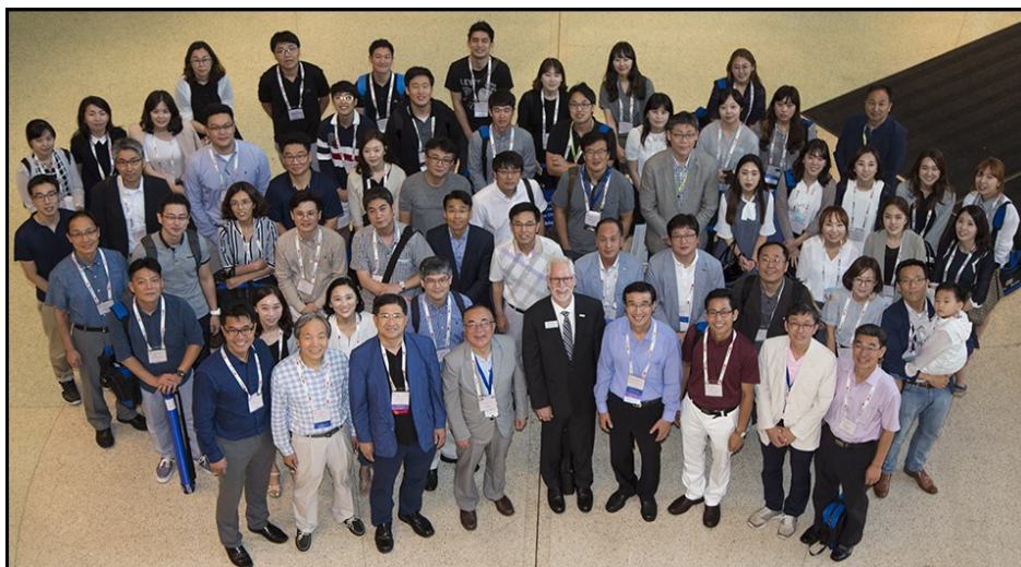
Members of the Korea Association for Food Protection met during IAFP 2016 in St. Louis, Missouri.

meeting's keynote speaker through IAFP's Expanded Speaker Program.