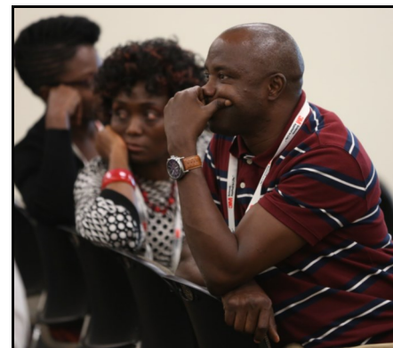
Attendees listen to topics of discussion during the AAFP Annual Meeting in St. Louis, Missouri.

some strides. Webinars are dynamic, engaging and convey information to a geographically-dispersed audience.