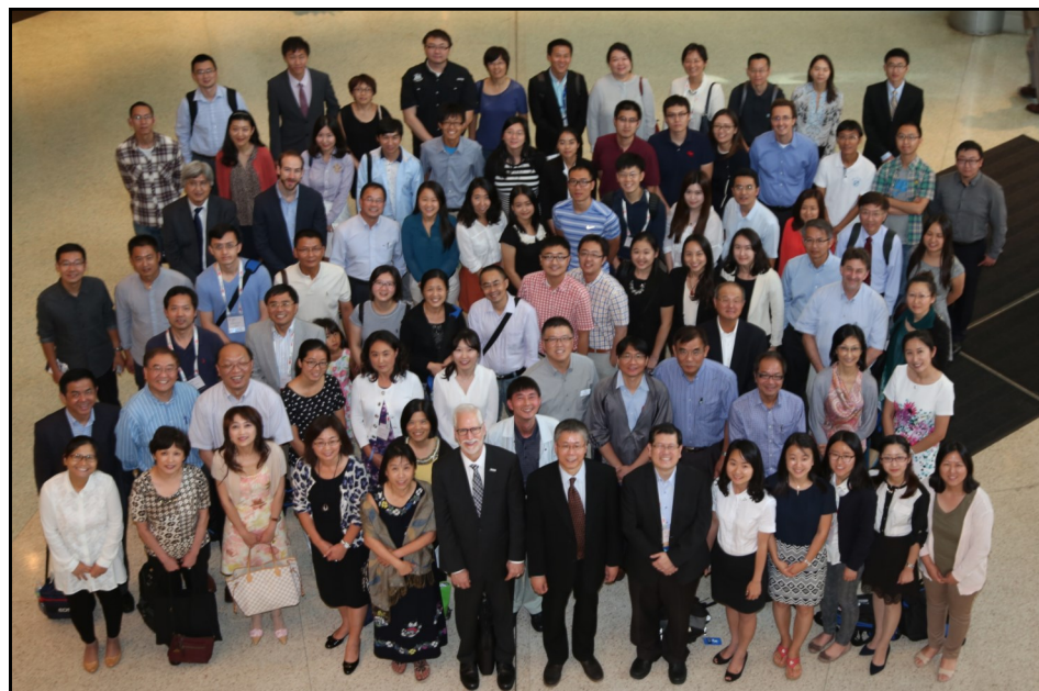
More than 80 attendees took part in the joint meeting of the China Association for Food Protection and the Chinese Association for Food Protection in North America during IAFP 2016 in St. Louis, Missouri.

The joint meeting of the Chinese Association for Food Protection (CAFP) and the Chinese Association for Food Protection in North America (CAFNA)